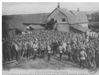
""The invasion of the modern barbarians 1914-1915", a postcard representing groups of German PoWs, taken in Souchez and at the Labyrinth (Department of Pas-de-Calais) in front of a Seine-et-Marne farm in 1915.

In the autumn, while the men were still at the front and the Battle of the Marne was in full swing in the northern