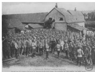
""The invasion of the modern barbarians 1914-1915", a postcard representing groups of German PoWs, taken in Souchez and at the Labyrinth (Department of Pas-de-Calais) in front of a Seine-et-Marne farm in 1915.

In the autumn, while the men were still at the front and the Battle of the Marne was in full swing in the northern