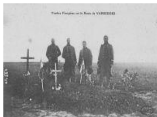
Postcard depicting soldiers standing by French graves on the road to Varredes.

The First World War is a recent enough event for family papers to provide the first pieces of information about the career of a soldier. It is not uncommon to find :