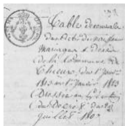
7 E 35, table décennale de Thieux (1813-1823) Thieux ten-year table (1813-1823) image 1 (AD77, 7 E 35)

The following civil registration documents are online :